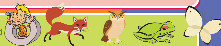
Our Course Venues