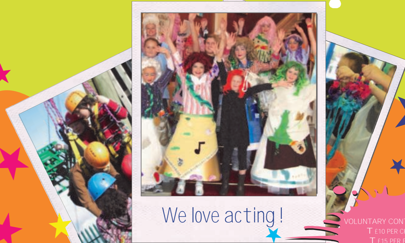
We love acting!

VOLUNTARY CONTRIBUTION T £10 PER CHILD T £15 PER FAMILY T Or any amount of your choice